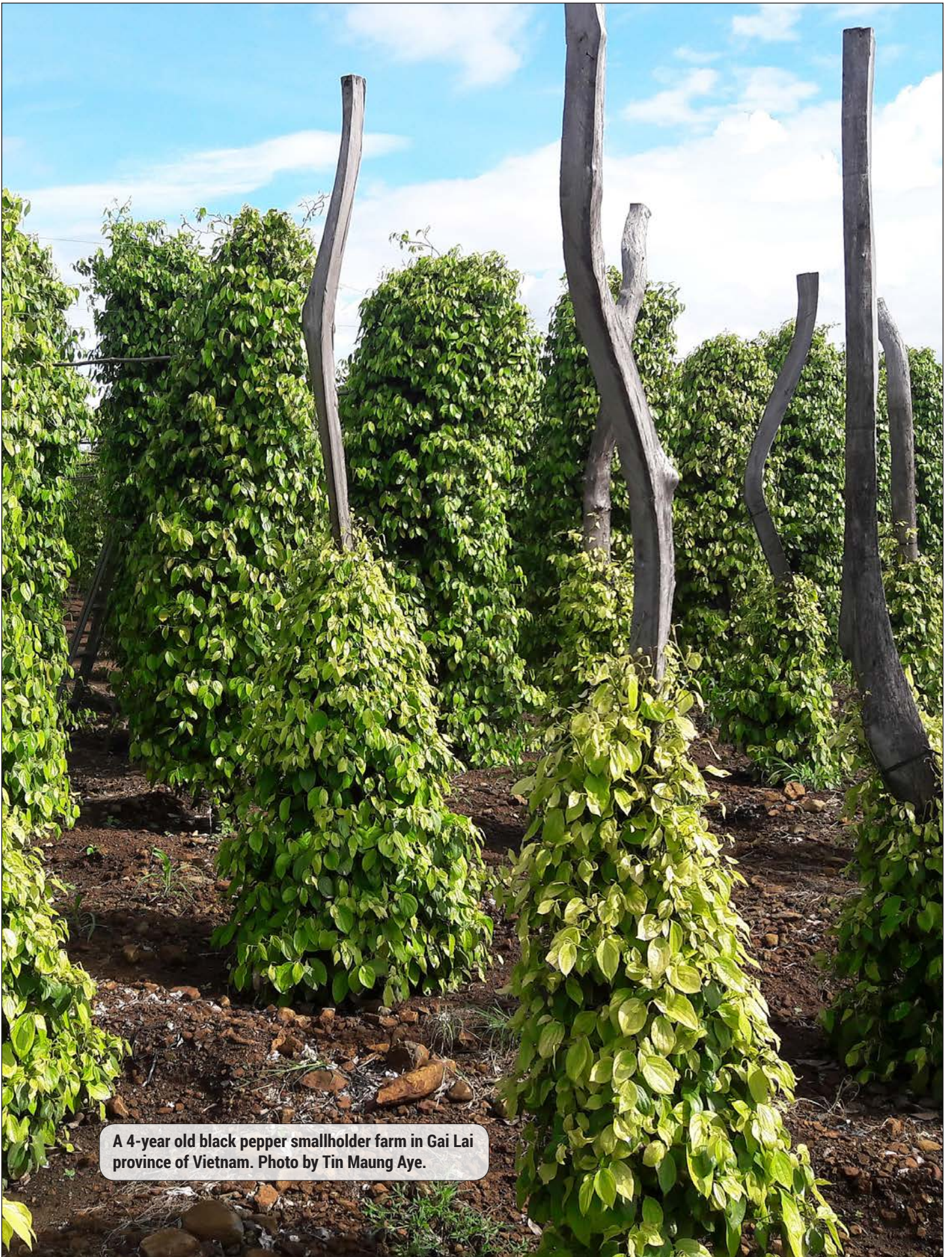
A 4-year old black pepper smallholder farm in Gai Lai province of Vietnam.