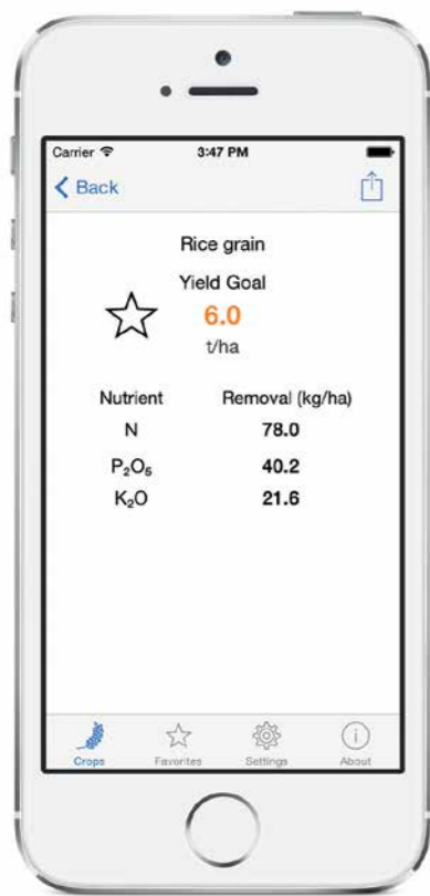
Figure 3: One of IPNI's Smart Phone Apps on calculating nutrient removals.

These groups provide support to research, and development of various knowledge products for out-scaling improved practices to the farmers. Packaging of improved nutrient management information in usable formats varies with target groups. With support from partners