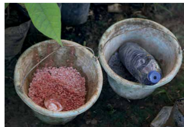
Figure 1. Supporting farmers to identify actionable interventions to apply fertilizer responsibly is at the heart of IPNI's communication efforts.

The IPNI, a not-for-profit organization supported by the world's leading fertilizer producers, focuses on improving crop productivity and farm profitability through sustainable use of plant nutrients. IPNI has a rich history of supporting a global plant nutrition research and education programmes