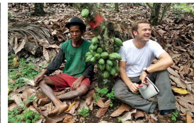
Figure 2. Dr. Oberthür having a conversation on crop nutrition with cocoa farmers in a learning farm in Sulawesi, Indonesia.

for over 80 years. Based out of Norcross, Georgia, IPNI programmes operate in more than 50 countries across the continents, contributing to plant nutrient management research and extension. IPNI's engagement is guided by the '4R Nutrient Stewardship Principles' of applying the right source of nutrients, at the right rate, at the right time and at the right place. This is at the core of IPNI's research and education programs. Defining and applying the 4Rs for appropriate crop-soil-climate context is expected to ensure optimum crop productivity and reasonable return on investment thereby reducing risk, and minimizing loss of nutrients from the rhizosphere to reduce environmental footprint. IPNI scientists join local researchers to define 4Rs for different crops and cropping systems that are grown under variable soils, tillage and crop establishment, water regimes and general crop management. IPNI programs operate in broad acreage as well as in smallholder production areas of the world. These two types of production areas have distinct differences in terms of number of people involved in farming, farm size, labour availability, farmer resource endowment, access to knowledge and use of modern agro-technologies. Locally relevant knowledge is communicated and disseminated through various mechanisms with the aim of reaching the end users for their on-farm implementation.